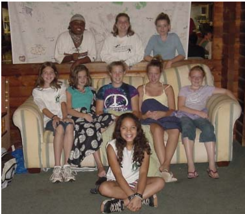
Campers posing at the end of a session of camp at Mount Shepherd Retreat Center, Asheboro, North Carolina

“Education is the most powerful weapon which you can use to change the world.” -Nelson Mandela