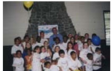
Governor Jeb Bush visiting with Camp Cool Kids.